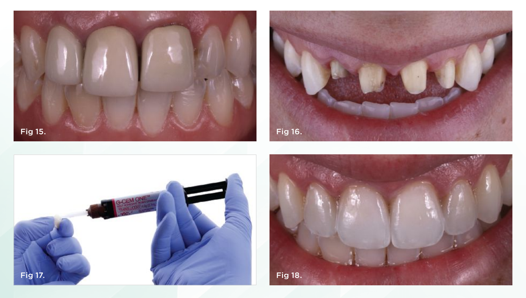
Fig 15. Initial situation demonstrating cosmetic concerns with existing metal-ceramic crowns on the right lateral incisor, sor, right central incisor, and left lateral incisor, and recurrent decay on the left lateral incisor of the maxilla. Fig 16. Sectioned and removed restorations/decay revealing clinically short tooth preparations. Fig 17. Following application of an adhesive primer to improve adhesion to the tooth substrate, a translucent SARC was used to lute the definitive full-coverage layered zirconia crowns. Fig 18. Final result on the day of delivery of four full-coverage layered zirconia crowns.

> To view the reference list, visit compendiumlive.com/go/cced2051.