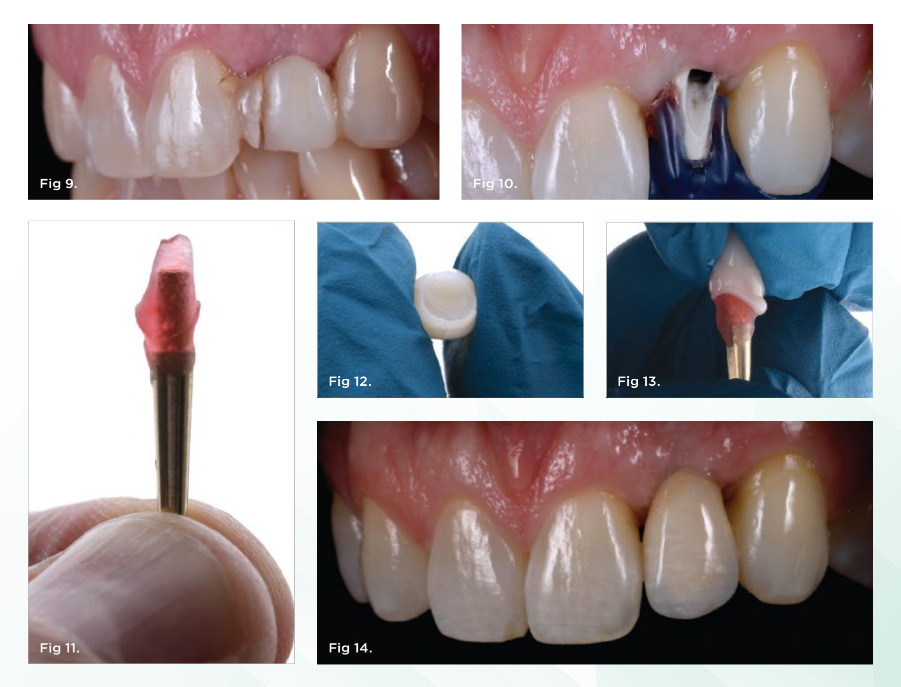
Fig 9. Initial situation showing failed resin-bonded pontic, maxillary left lateral incisor. Fig 10. Non-retentive metal implant abutment with orientation jig in place. Fig 11. Laboratory-fabricated copy abutment. Fig 12. The implant crown was filled with SARC. Fig 13. Seating of the all-ceramic crown on the copy abutment to displace excess cement just prior to final delivery. Fig 14. Delivery of cement-retained implant crown demonstrating minimal tissue irritation following immediate clean-up of excess cement.

A 29-year-old female patient presented for a cosmetic evaluation of existing metal-ceramic restorations (MCRs) on her maxillary right lateral and both central incisors (Figure 15). Her dental history revealed incidence of blunt force trauma