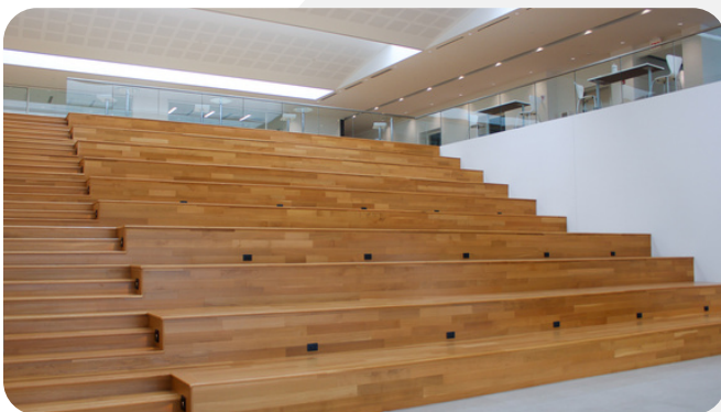
GRAND STAIRCASE, MEETING SPACE