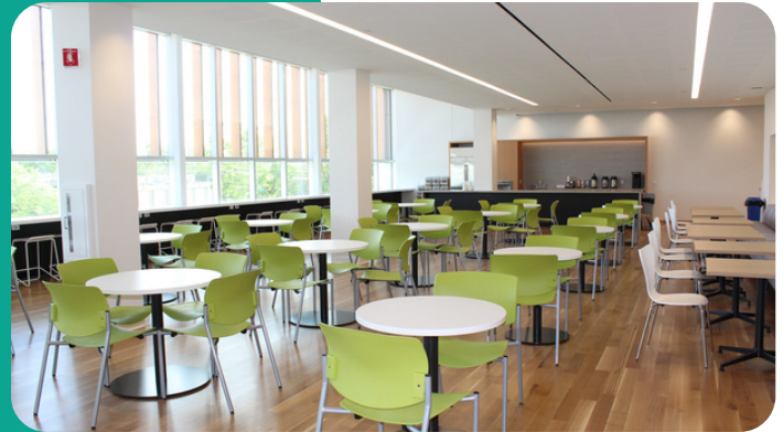
GC AMERICA LUNCHROOM