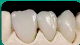
Result after one firing.