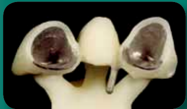
GC Initial IQ - One Body, Press-over-Metal is a feldspar based pressable ceramic system for conventional porcelain alloys (CTE/WAK range 13.8 to 14.9).

This new concept of pre-blended effect ingots in combination with the 3-D GC Initial IQ Lustre Pastes NF exhibits vitality and a natural lustre. This new development is standardized, compact and easy to use. By using this unique "One Body Concept", you are making better use of your time and can now enjoy the benefits of higher accuracy, fewer remakes and optimized productivity without sacrificing customer service or quality. Introduce GC Initial™ IQ – One Body Concept in your lab and maximize your existing resources and get a higher revenue from your dental business.