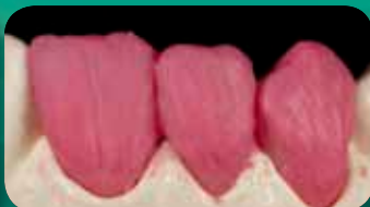
Full contour application of a Base Powder.