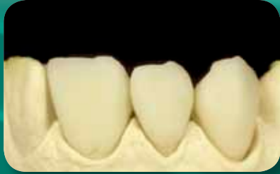
Full contour bridgework