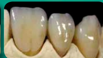
Final restoration after one firing.