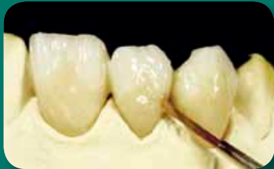
Application of Lustr Pastes