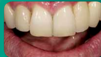
ONE Highly Esthetic Result