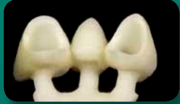
GC Initial IQ - One Body, Press-over-Zircon is a feldspar based ceramic that demonstrates outstanding lifelike esthetics and merges both the pressable and CAD/CAM technologies.