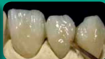
Application of Lustre Paste Body Shade.