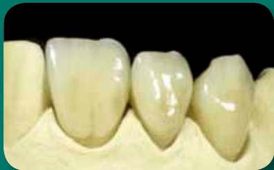
Final restoration after only 1 firing