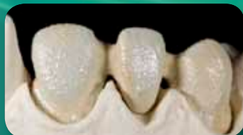
Metal framework perfectly masked with GC Initial MC Paste Opaque.