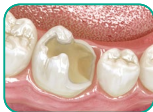
Prepare the cavity