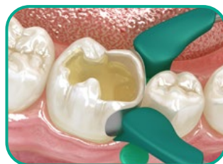
In case of a Class II cavity, build the missing walls with a conventional composite