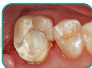
Fiber post cemented with GC FujiCEM® Evolve