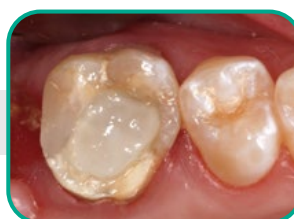
everX Flow™ base application