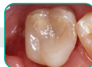
Ready for crown preparation