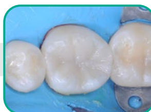
Layered with G-aenial Sculpt®