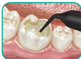
Fill the cavity with everX Flow™