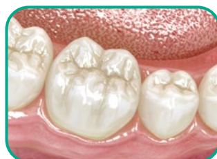
Final result after covering with a conventional composite

everX Flow™ provides an excellent foundation for your larger restorations