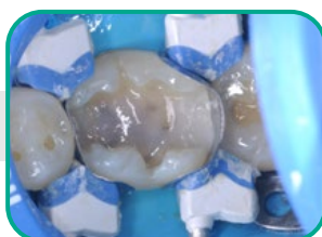
everX Flow™ base application