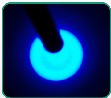
The Light (uniform concentrated light increases polymerization performance)

The Light 405 operates from 405 nm - 490 nm to meet all standard light curing needs, with the same intensity modes as The Light. The Light 405 includes a dual wavelength processor designed to meet all standard operator light curing needs, including that of OPTIGLAZE™ color, GC's Light-Cured Characterization Coating for Composite and Acrylic Indirect Restorations.