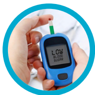
Chronic illnesses (e.g. diabetes, lupus)