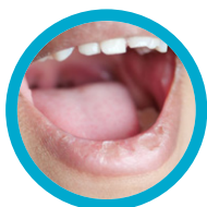
Salivary gland disorder