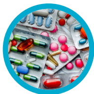
Certain medication oral side effects