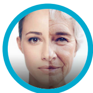
Ageing, anxiety and Post-menopausal women