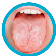
Sjögren's syndrome, Parkinsons, HIV/AIDS