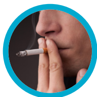
Smoking, vaping and alcohol