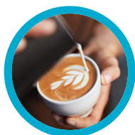
Excessive caffeine intake