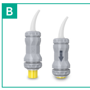
Make sure to depress plunger and hold it down for 2 seconds .