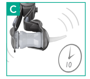
Mix for 10 seconds.