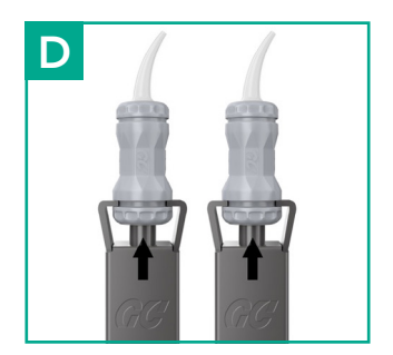
Two clicks to prime capsule then syringe slowly.