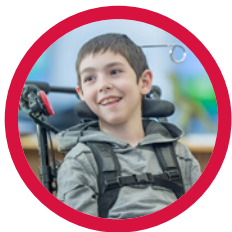
Oral care support for aged care and special needs