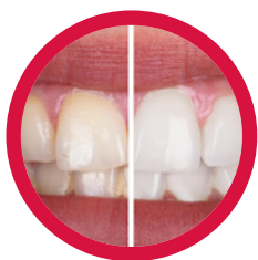
Before and after tooth whitening