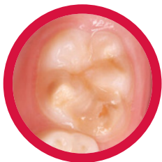
Dental developmental defects and chalky teeth