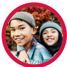
Children over the age of 6 and adolescents