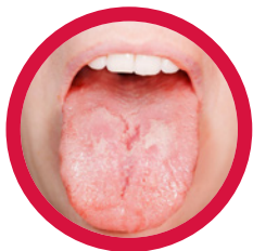
Dry mouth conditions and Xerostomia