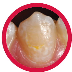
Prevention of tooth decay