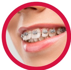
During and after orthodontics (braces and clear aligners)