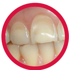
Erosion, oral acids from reflux and morning sickness