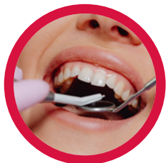
After professional cleaning and scaling