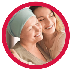
Chronic disease sufferers and certain medication- related oral side effects