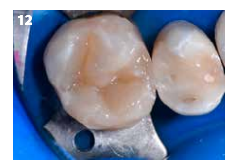
Fig. 12. With the remaining two cusp slopes, the restoration of the occlusal surface is completed.

Fig. 10. The mesiopalatal cusp is always restored first. Being the largest of the four cusps, its correct design is crucial.