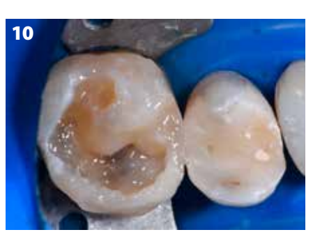
Fig. 10. The mesiopalatal cusp is always restored first. Being the largest of the four cusps, its correct design is crucial.

In the next step, the disto-buccal cusp is created (Fig. 11). This essentially defines the crista transversa and thus the occlusal morphology. In contrast to conventional composites, with G-ænial Universal Injectable, the cusp slopes can be modelled with the application tip; no further modelling instruments are required.