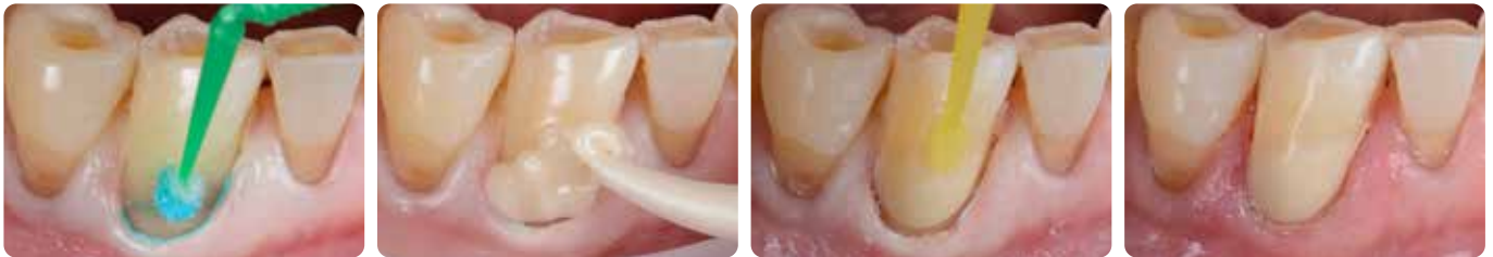
Cervical restoration with EQUIA Forte HT

EQUIA Forte HT , a glass hybrid restorative, has a pleasant consistency to pack and contour. The EQUIA Forte Coat gives it a nice, wear resistant finish and gloss, and additionally adds to its strength by creating the right environment for the material to mature and strengthen. Its ease of placement is especially convenient when treating root caries because of the moisture tolerance and the speed of treatment; it can even be sculpted simply by using a finger. Moreover, through ion exchange, these restorations stimulate tooth remineralisation and prevent demineralisation and therefore the best option for active lesions.