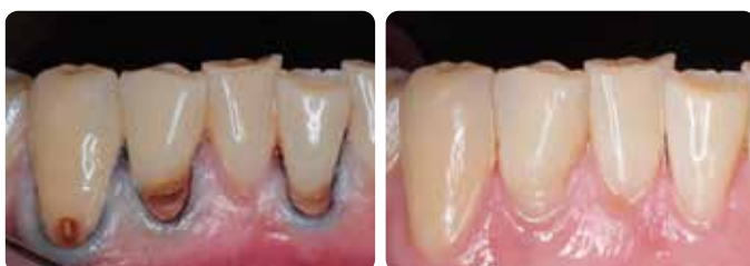
MI restorations of root caries lesions with Fuji II LC, one month after placement.

Fuji II LC is indicated for any case where speed and ease of use are priorities. This might be the case in patients who cannot cooperate well, lacking the necessary cognitive or physical abilities to fully cooperate. These restorations show good survival rates. 7