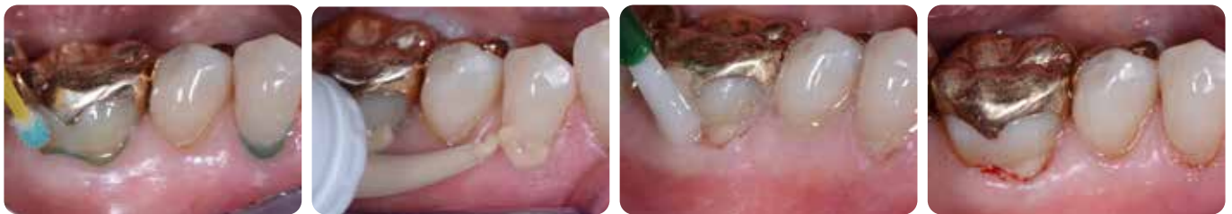
Restoration of root caries lesions with Fuji TRIAGE, followed by MI Varnish application.