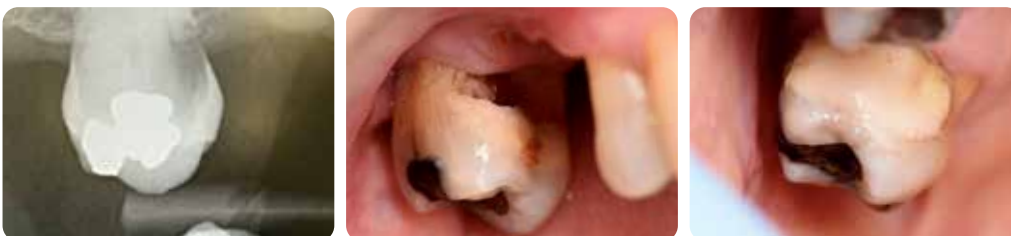
ART subgingival restoration with EQUIA Forte HT

Even though in many cases, Atraumatic Restorative Treatment (ART) won't be the first option, this technique can be applied in case of highly dependent patients who do not manage to come to the dental practice or in any other situation where the use of rotary instruments is not an option. 6,10 Powder/Liquid versions are available to work in absence of a capsule mixer. In the ART technique, only the infected dentine is removed but the affected/ leathery dentine close to the pulp is kept, which helps keeping pulp vitality and avoids sensitivity. Perfectly clean margins will ensure the success of the restoration. In most cases, anaesthesia is not necessary.