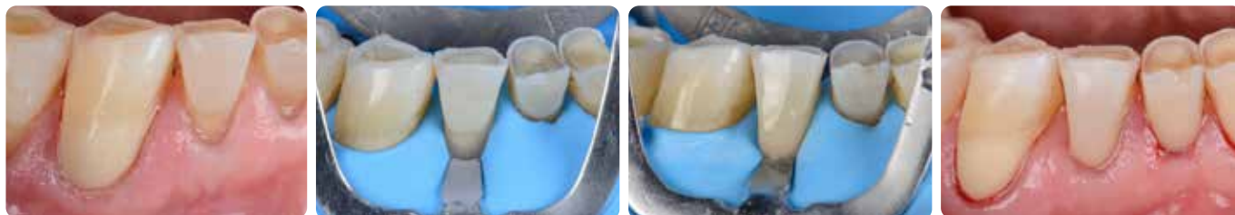
Highly aesthetic cervical restoration with G-ænial Universal Injectable

Apart from that, its bendable tip and thixotropic behaviour makes it easy to access even posterior cavities and to control the placement in difficult areas. It comes in many shades, making it possible to make a truly aesthetic and inconspicuous restoration - which is requested increasingly often by patients.