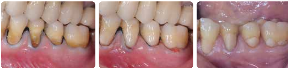
EQUIA Forte (the predecessor of EQUIA Forte HT) restorations before treatment (left), at baseline (middle) and after 6.5 years of function (right).

Even though in many cases, Atraumatic Restorative Treatment (ART) won't be the first option, this technique can be applied in case of highly dependent patients who do not manage to come to the dental practice or in any other situation where the use of rotary instruments is not an option. 6,10 Powder/Liquid versions are available to work in absence of a capsule mixer. In the ART technique, only the infected dentine is removed but the affected/ leathery dentine close to the pulp is kept, which helps keeping pulp vitality and avoids sensitivity. Perfectly clean margins will ensure the success of the restoration. In most cases, anaesthesia is not necessary.