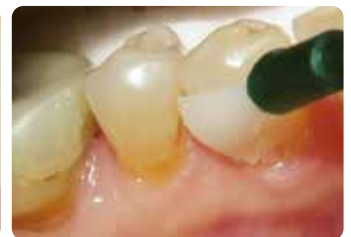
In office application of MI Varnish

RECALDENT™ is derived from milk casein. Do not use on persons with a milk allergy. In case of allergic reaction: stop use, rinse mouth with water, and seek medical advice.