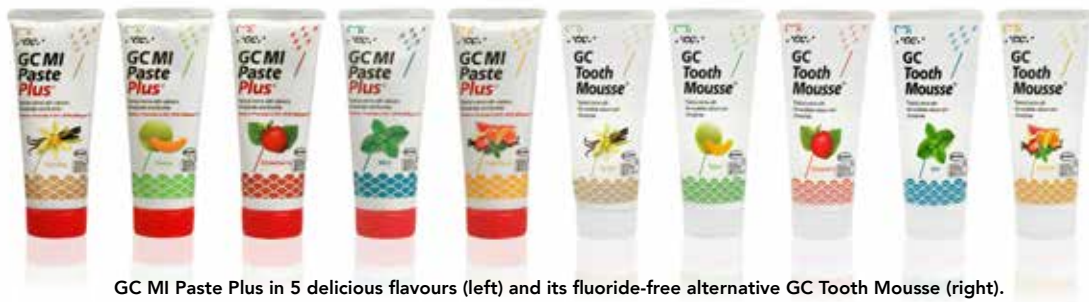
GC MI Paste Plus in 5 delicious flavours (left) and its fluoride-free alternative GC Tooth Mousse (right).

GC MI Paste Plus contains RECALDENT (bio-available amorphous calcium phosphate; CPP-ACP) as well as fluoride (900 ppm). It can be used overnight to enhance tooth repair and reduce hypersensitivity. It is available in 5 delicious flavours that increase patient acceptance. Patients with decreased salivary flow tend to show a preference for Vanilla flavour.