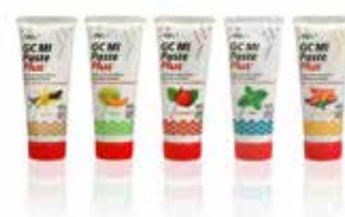
MI Paste PLUS Bio-available calcium and phosphate, with fluoride