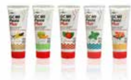
MI Paste Plus Bio-available calcium and phosphate, with fluoride