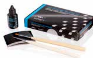
Composite modeling kit Kit to model composite restorations