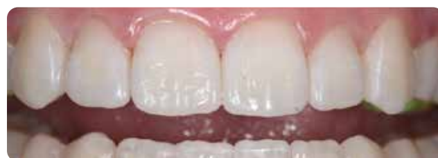
Restoration of incisal edges with a single shade of G-ænial A'CHORD. Courtesy: Dr Urszula Witek-Furman, Poland