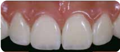
Teeth with a natural play of light.