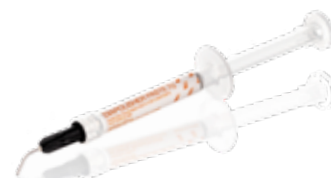
DiaPolisher Paste Diamond polishing paste