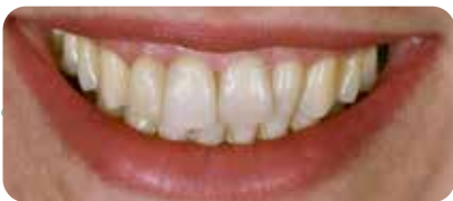
Seamless and smooth restorations for a healthy gingiva.