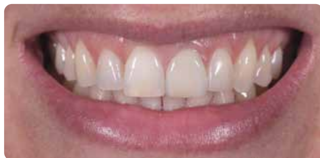
Reshaping of a lateral incisor with G-ænial A'CHORD.