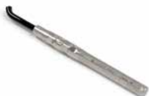
D-Light Pro Dual wavelength LED curing light