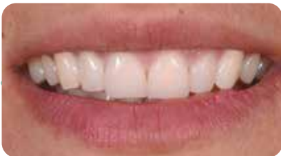
Seamless transition and excellent blending of the restorations.