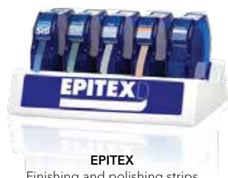
EPITEX Finishing and polishing strips