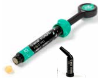
G-ænial A'CHORD Advanced universal composite with unishade simplicity