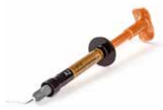
G-ænial Universal Injectable High-strength restorative composite