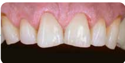
Glossy, inconspicuous restorations.