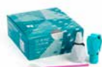
G2-BOND Universal Two-step universal bonding agent