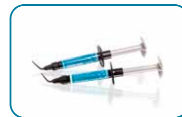
everX Flow™ Fibre-reinforced flowable composite for dentine replacement