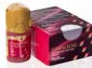
G-Premio BOND Universal bonding agent