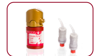
EQUIA Forte™ HT Cost-effective, long-term restorative alternative