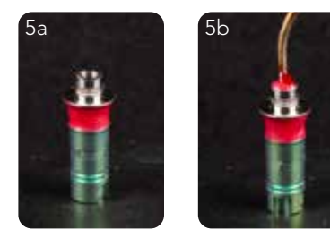
Block the screw channel and protect the margins with wax. Only the bonding surface should be exposed.