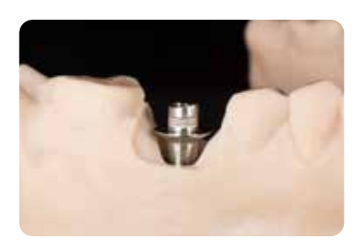
Implant analog + Ti-base abutment