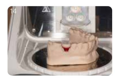
Light cure each side for 20 seconds with a Halogen/LED lamp with minimum of 700 mW/cm<sup>2</sup> (wavelength between 430 and 480 nm).