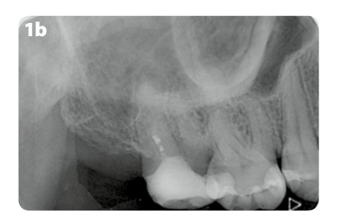
Figure 1: Initial situation. a) Intraoral view, showing an MOD restoration with discoloured margins on tooth #16; b) Radiograph of the initial situation revealing secondary caries on tooth #16.

eating sweet or sour food. Upon clinical and radiographical examination, secondary caries was found on the proximal areas of tooth #16 (Fig. 1).