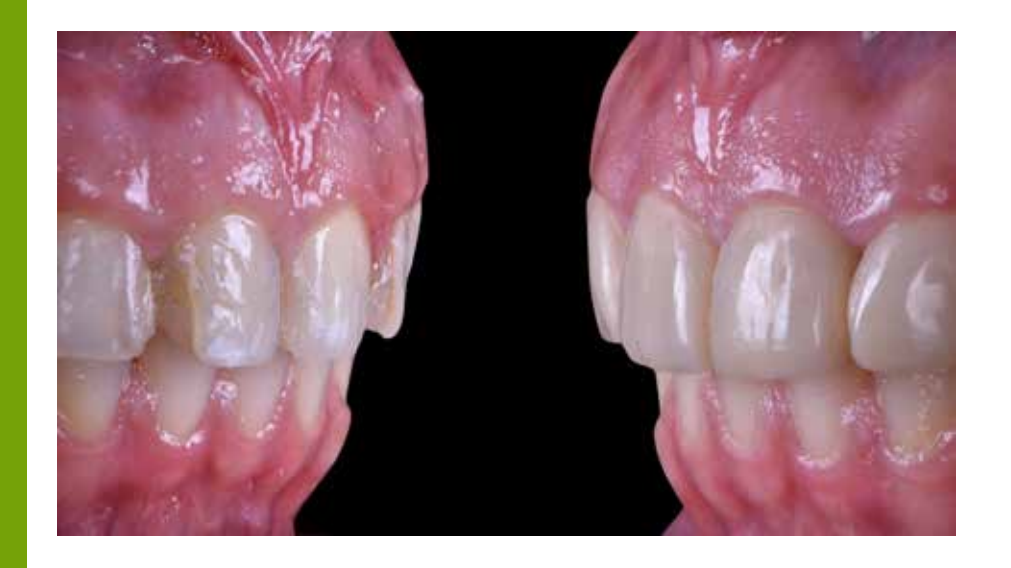
Fig. 1: Initial situation (left) and final result (right)

Discolourations of the anterior dentition are one of the main aesthetic problems for many patients. These problems can be solved with direct and indirect restorations. Minimally invasive direct composite veneer restorations have become very popular with the recent developments in adhesive dentistry (Fig. 1)