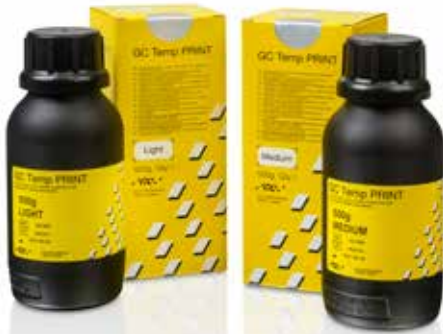
GC Temp PRINT