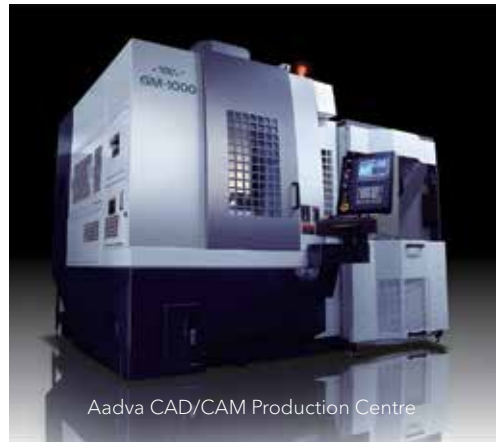
Aadva CAD/CAM Production Centre