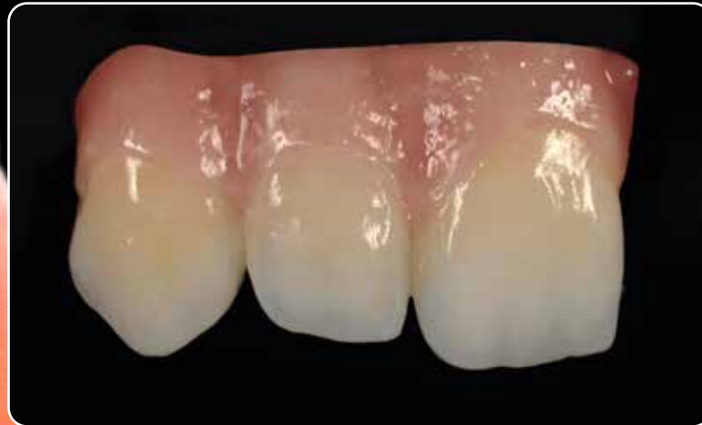
Self-glazing properties. Get a beautiful glazed finish in one single firing.