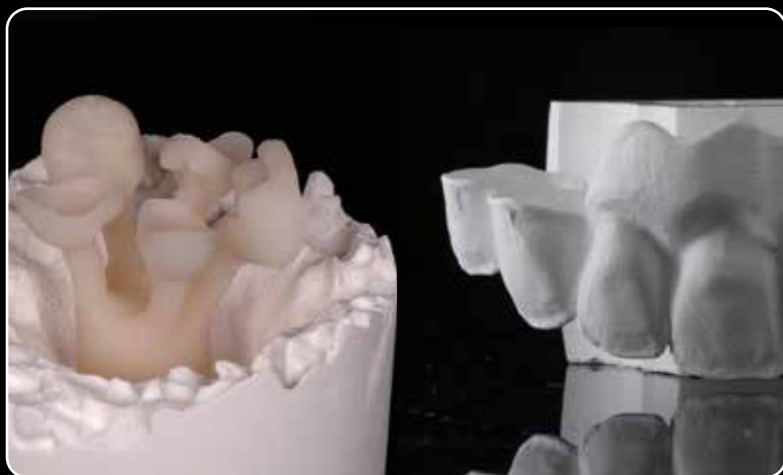
...for all your Zr and LDS full ceramic realizations