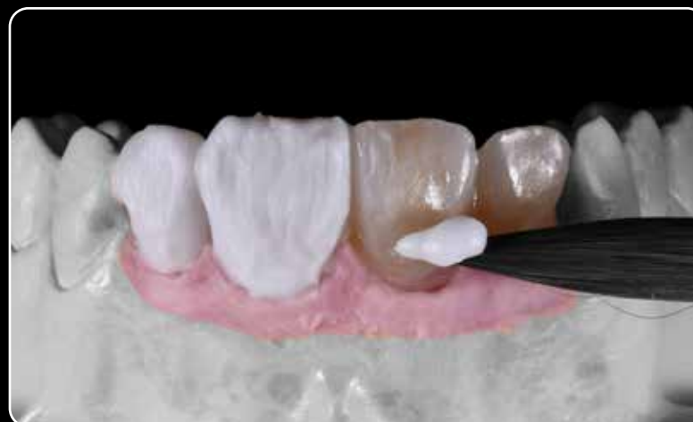
...for micro-layering as well as painting techniques