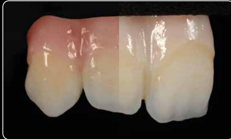
Initial IQ Lustre Pastes ONE also serve as connection firing.