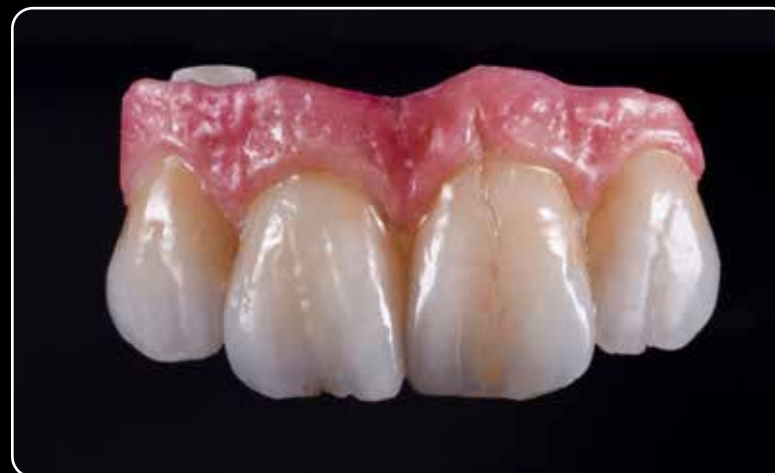
Red and white aesthetics