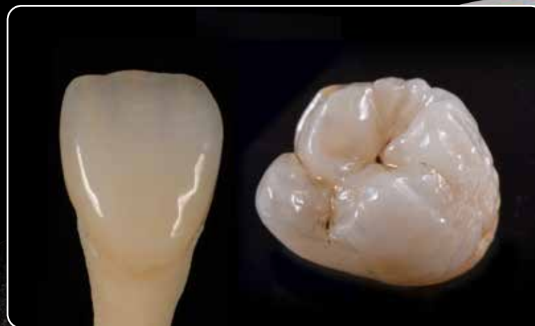
...for anterior and posterior restorations