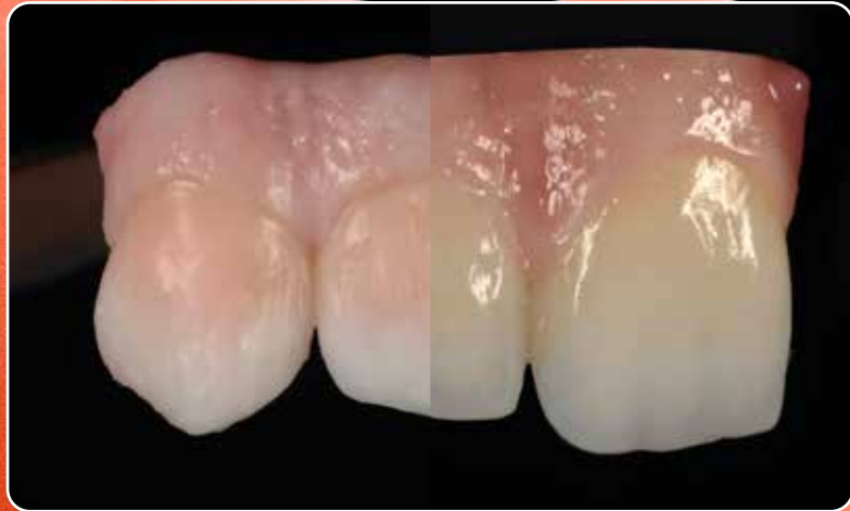
Create form and fine texture in the wet stage. No changes after firing.