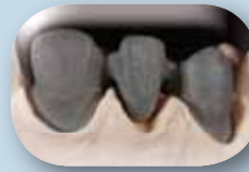
Cast or CAD/CAM made metal frameworks.