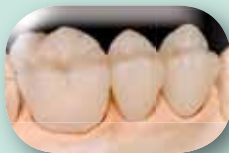
Result after one firing.