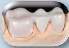
Zirconium dioxide framework.