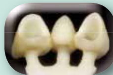
Result after pressing.