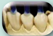
After the Opaque firings, a full wax up with the aid of a pre-fab wax system is made. 0,8 mm thickness to reach an acceptable aesthetic end-result.