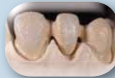
Apply a Opaque layer (wash) with the normal GC Initial MC Paste Opaques using a flat brush. Before firing Fluo crystals are applied on the Opaque surface.