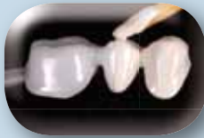
Apply a layer of GC Initial IQ Light Reflective Liner to mask the Zirconium framework.