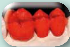
Full contour application of a body powder.