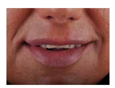
Fig. 1b: Mouth in rest