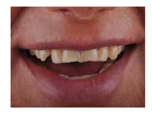
Fig. 1a: Patient's smile

A 40-year-old female patient who was unhappy with the appearance of her maxillary frontal teeth presented at the dental office. Clinical examination revealed severe erosion of the maxillary anterior teeth with loss of vertical dimension, in a pattern strongly suggestive for erosion by gastric acid (Figure 1). The patient had suffered from bulimia nervosa in the past.