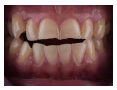
Fig. 1c: Vertical reduction of the frontal teeth by severe erosion.