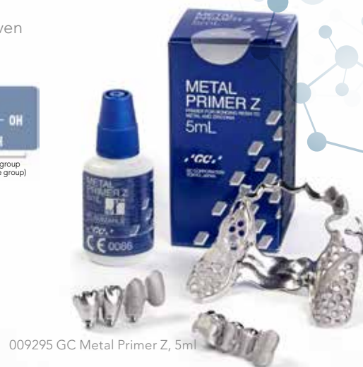
009295 GC Metal Primer Z, 5ml

Whenever you have to work with metal based frameworks and resin based materials, choose this all-round hero of all time.