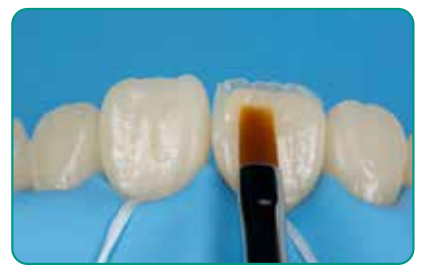
Apply the dentin paste using the flat brush.