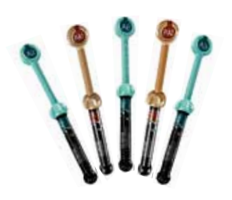
G-ænial Anterior / Posterior