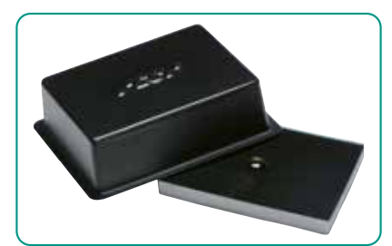
Use it quickly and protect it from the light with a cover.