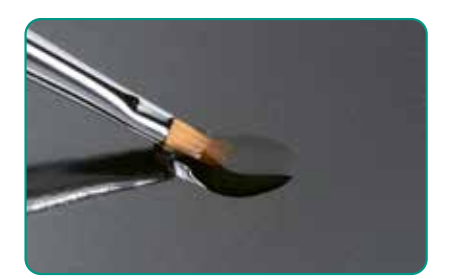
Touch the drop with the brush in order to moisten it.