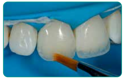
A smooth finish for a shorter finish- the best aesthetic ing procedure

Using a brush wetted with a modeling liquid makes composites less sticky, resulting in easier and faster application & shaping.