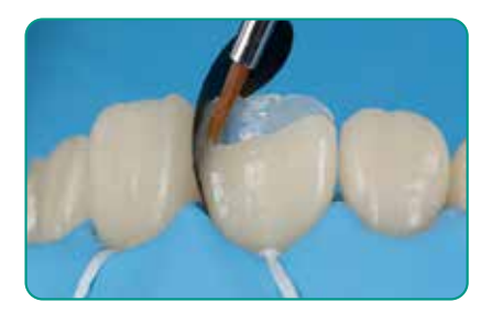
A round brush can be useful to create the interproximal part.