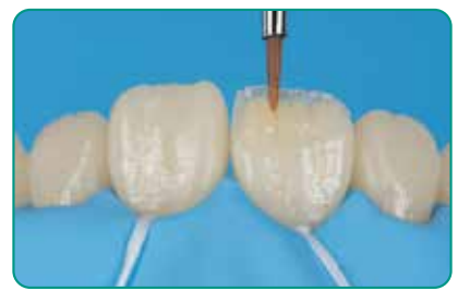
Model the dentin mamelons using a round brush.