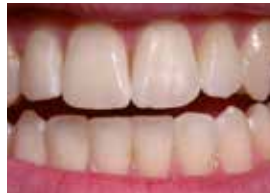
After regular use of Tooth Mousse