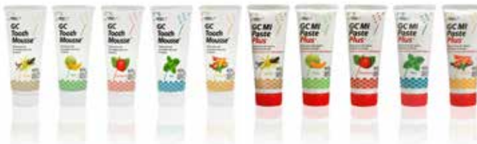
Mint • Strawberry • Vanilla • Melon • Tutti Frutti