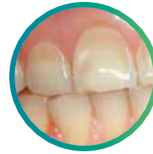
Erosion, reflux and morning sickness