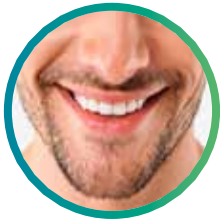
Daily protection of oral health