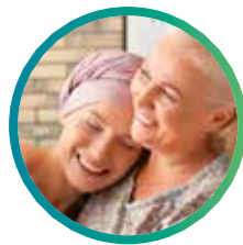
Chronic disease sufferers and multiple medication use