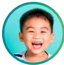
Children and adolescents