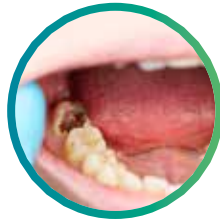
Prevention of tooth decay