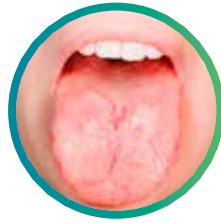
Dry mouth conditions and xerostomia