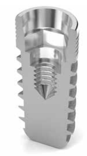
Hexagonal interlocking of the conical sealed connection.

• Simplifies the fitting and positioning of prosthetic parts.