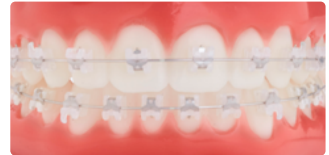
EXPERIENCE ceramic with aesthetic archwires.

In order to make your appliance even more aesthetic, your Orthodontist can propose EXPERIENCE Ceramic. These translucent attachments are close to invisible. The metal part (clip) is whitened to give your entire appliance a «tooth-like» color. In some cases, ceramic attachments are not recommended. Your Orthodontist will tell you.