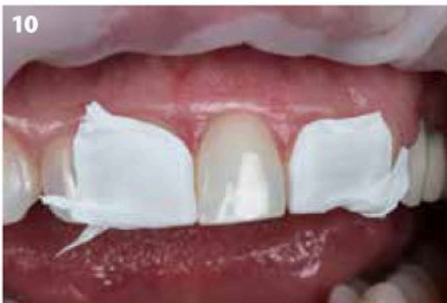
Fig. 10: Neighbouring teeth 11 and 22 were isolated using Teflon tape.

A fine, needle-shaped bur was used to drill the holes in the key through which the composite will be injected (Fig. 8). These holes were positioned at the middle of the incisal edge of each tooth, half-way between the distal & mesial borders, and made as small as possible but large enough to enable the tip of the composite syringe to pass easily and completely (Fig. 9). Care was taken not to damage the vestibular part inside the silicone key with the bur, to maintain the information of surface texture that had been created during the wax-up. This will guarantee a proper transfer and respect the idea of a predictable final aesthetic result.