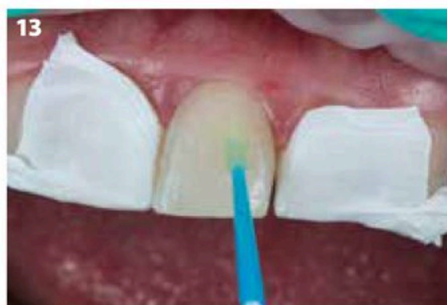
Fig. 13: The universal adhesive G-Premio BOND (GC) was applied in accordance with the manufacturer's instructions and light-cured.

After cleaning, the procedure was started with a central incisor. The neighbouring teeth were isolated with Teflon tape (Fig. 10). Then, the enamel was etched (Fig. 11) to create extra micromechanical retention, carefully rinsed and dried. A frosty appearance of the surface was obtained (Fig. 12). A universal adhesive (G-Premio BOND, GC) was applied, left undisturbed for 10 seconds and thoroughly dried with maximum air pressure for 5 seconds before light-curing (Fig. 13).