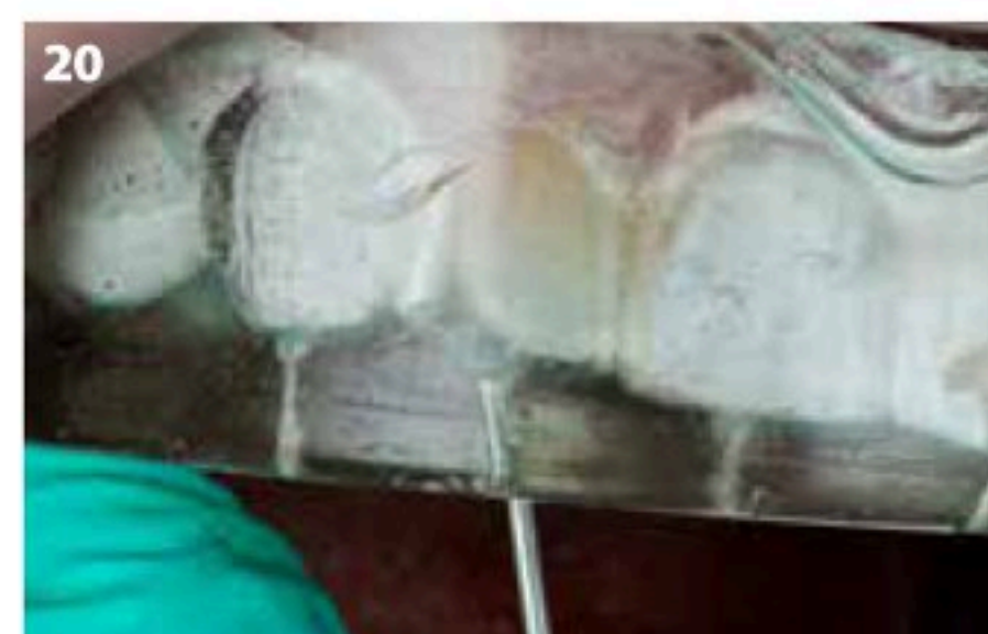
Fig. 20: Injection of G-aenial Universal Injectable (GC) into the EXACLEAR key.