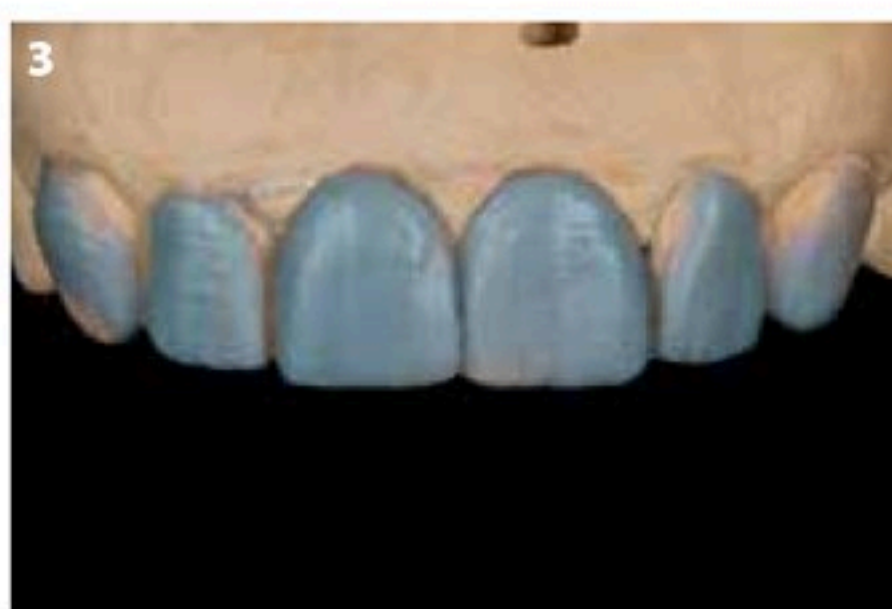
Fig. 3: A wax-up was made in consultation with the patient.

A wax-up was made of the desired tooth morphology that had been defined in consultation with the patient (Fig. 3). Next, a non-perforated metal impression tray was filled with a transparent vinyl polysiloxane material (EXACLEAR, GC) and placed over the stone model with the wax-up (Fig. 4-5). The tray's only purpose being to be used as a mould to create the key, a full-arch tray with a smooth inner surface was selected so that the silicone could