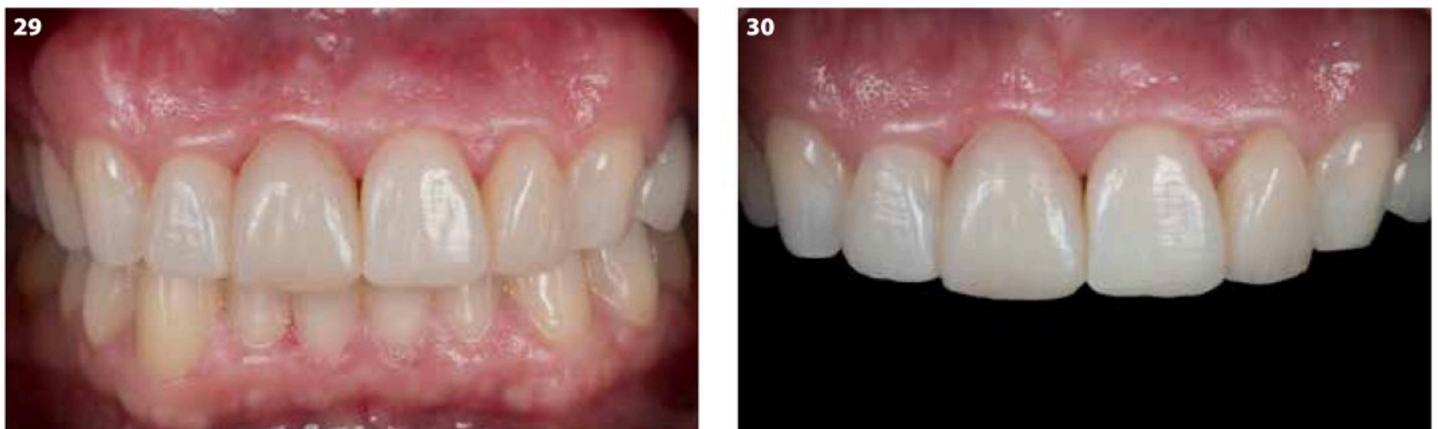
Fig. 29-30: Result after final polishing.

which saves valuable chair-time. In order to have a long-lasting result, the composite needs to have good mechanical properties. Considering the interesting properties of G-aenial Universal Injectable, being even stronger than many paste composites, it can be safely used for that purpose.