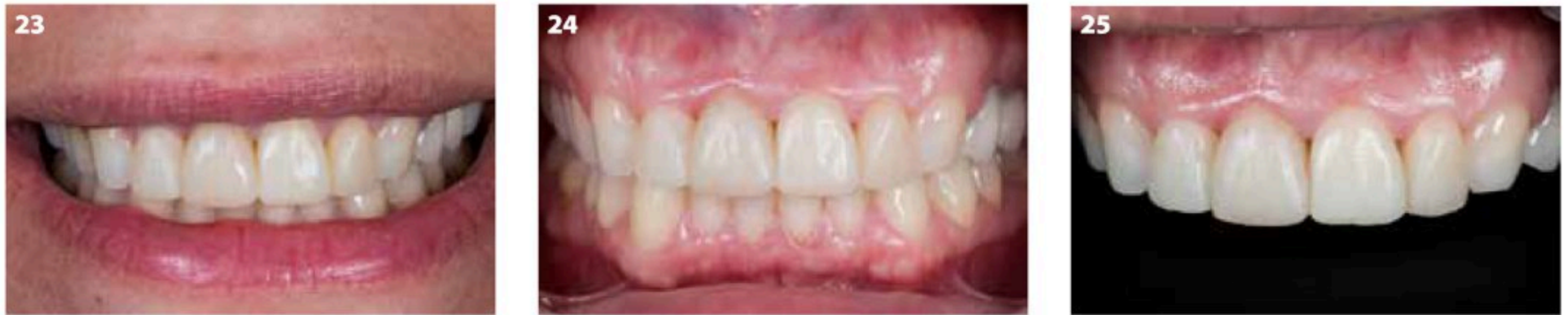
Fig. 23-25: Gingival healing 3 days after the treatment.