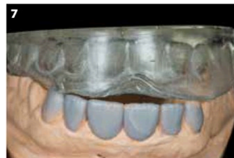
Fig. 4-7: A metal impression tray was filled with transparent vinyl polysiloxane (EXACLEAR, GC) and used to copy the stone model with the wax-up.