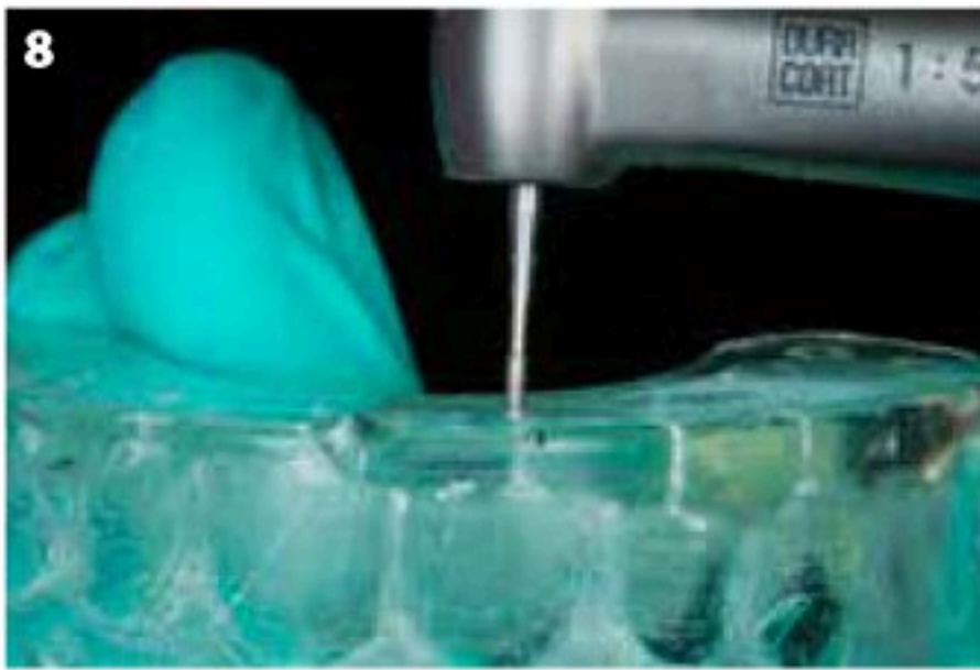
Fig. 8: A needle-shaped bur was used to drill holes through the silicone key ending in the middle of the incisal edge.