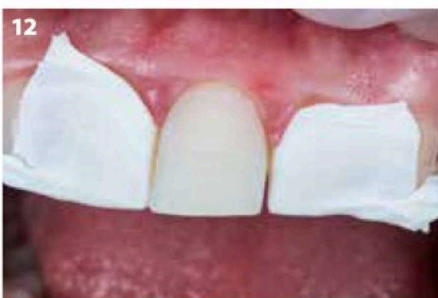
Fig. 12: After etching, the enamel surface showed a matt appearance.