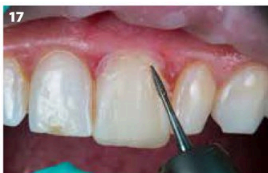
Fig. 17: A flame-shaped finishing bur was used.