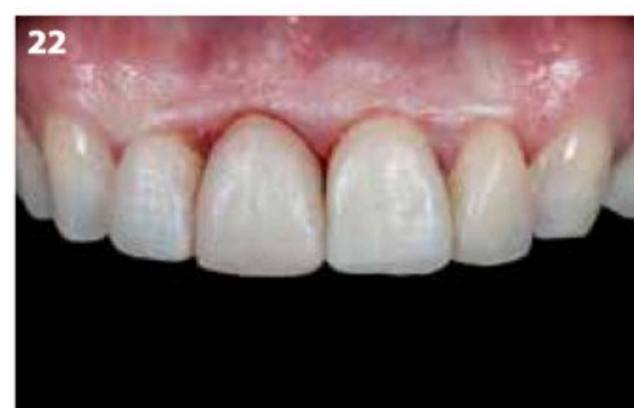
Fig. 21-22: Result immediately after curing the composite.