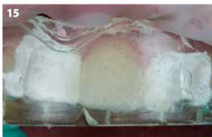
Fig. 15: Due to the high transparency of the key, it can be visually checked if a sufficient amount of composite has been injected to cover the entire surface. The composite can also be easily light-cured through the key.

Next, the silicone key was positioned onto the teeth and the composite was injected (Fig. 14). G-aenial Universal Injectable (GC), shade A1 was selected for the procedure because of its high filler load and wear-resistance. The syringe was placed in the hole and slightly orientated towards vestibular. During the injection, a little bit of overflow is needed to ensure that all small voids at the margins and interproximal spaces are filled. This can easily be verified through the transparent key (Fig. 15). Next, G-aenial Universal Injectable was light-cured through the transparent silicone. After removal of the key, the excess was taken out with a surgical scalpel blade (blade #12, Swann-Morton; Fig. 16). Further finishing was done with a flame-shaped bur at the cervical margin, to correct any possible overcontouring, (Fig. 17) and with metal strips (New Metal Strips, GC) interproximally (Fig. 18). Metal strips are more rigid than transparent ones, which makes them more efficient and easier to use. Note that even though some bleeding might occur during this stage, finishing and polishing should be carried out thoroughly as smooth margins will help the gingiva to heal faster but also maintain the gingival health over time. The same procedure was repeated on the other incisors and the canines (Fig. 19-20).