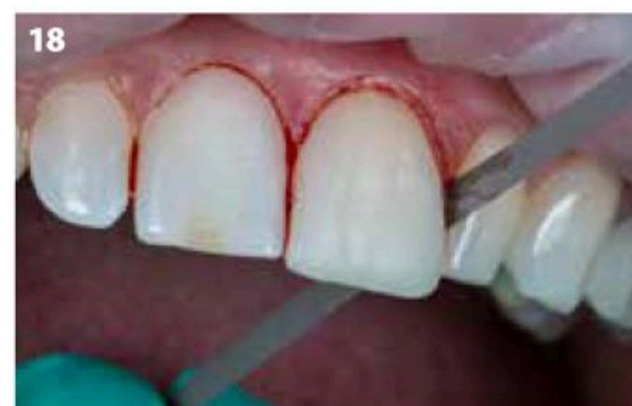
Fig. 18: Interproximally, the margins were finished with metal strips.