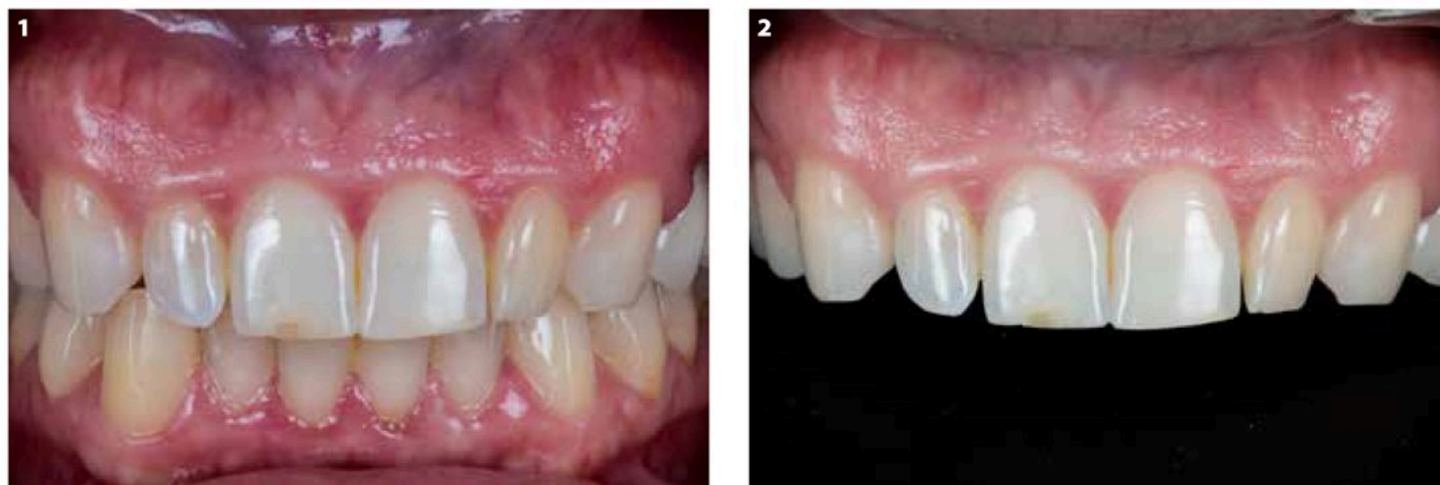
Fig. 1-2: Initial situation.

A 34-year-old, pregnant woman came to the dental office with the request to improve the aesthetic appearance of her smile. Her chief complaint concerned the shape of the lateral incisors (Fig. 1-2). She had already undergone a bleaching treatment and two veneer-lays on the heavily discoloured teeth 14 and 15, due to endodontic treatments covered with voluminous amalgam restorations in the past. After explaining the different options, she decided to go for a treatment with direct composites because of financial reasons and the idea of the minimally invasive nature of the procedure.