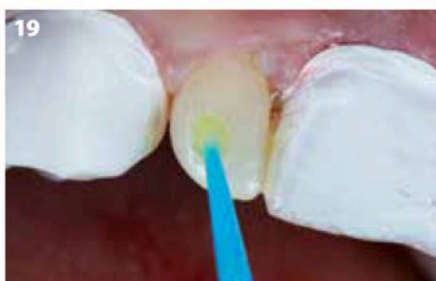
Fig. 19: The same procedure as shown for tooth 21 was repeated for the other teeth. Application of G-Premio BOND on tooth 12.