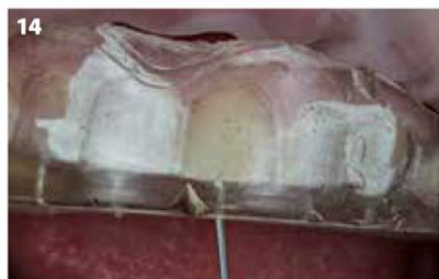
Fig. 14: G-aenial Universal Injectable (GC) was injected into the silicone key.

Next, the silicone key was positioned onto the teeth and the composite was injected (Fig. 14). G-aenial Universal Injectable (GC), shade A1 was selected for the procedure because of its high filler load and wear-resistance. The syringe was placed in the hole and slightly orientated towards vestibular. During the injection, a little bit of overflow is needed to ensure that all small voids at the margins and interproximal spaces are filled. This can easily be verified through the transparent key (Fig. 15). Next, G-aenial Universal Injectable was light-cured through the transparent silicone. After removal of the key, the excess was taken out with a surgical scalpel blade (blade #12, Swann-Morton; Fig. 16). Further finishing was done with a flame-shaped bur at the cervical margin, to correct any possible overcontouring, (Fig. 17) and with metal strips (New Metal Strips, GC) interproximally (Fig. 18). Metal strips are more rigid than transparent ones, which makes them more efficient and easier to use. Note that even though some bleeding might occur during this stage, finishing and polishing should be carried out thoroughly as smooth margins will help the gingiva to heal faster but also maintain the gingival health over time. The same procedure was repeated on the other incisors and the canines (Fig. 19-20).