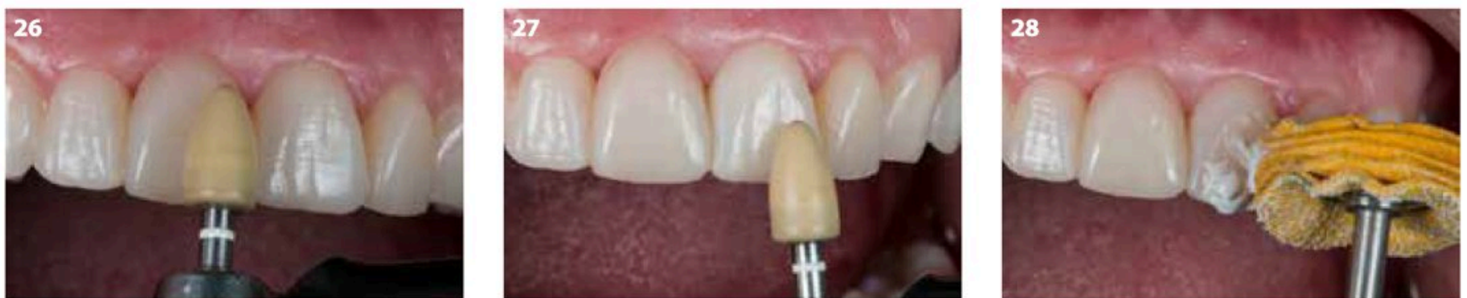
Fig. 26-28: Final polishing was done at the recall session.

Immediately after, it can be seen that the surface texture of the wax-up was transferred in detail to the direct veneers in the oral cavity, which gives the teeth a very natural and lifelike appearance (Fig. 21-22). Three days after the treatment, the gingival tissue had healed entirely (Fig. 23-25). In the recall session one week later, the surface was polished again with soft rubbers and cotton wheels with polishing paste