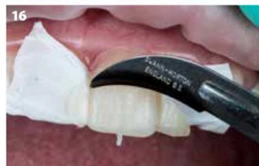
Fig. 16: The excess was removed with a scalpel (blade #12). Due to the presence of the Teflon tape, the excess did not stick to the neighbouring teeth and it was easy to remove.