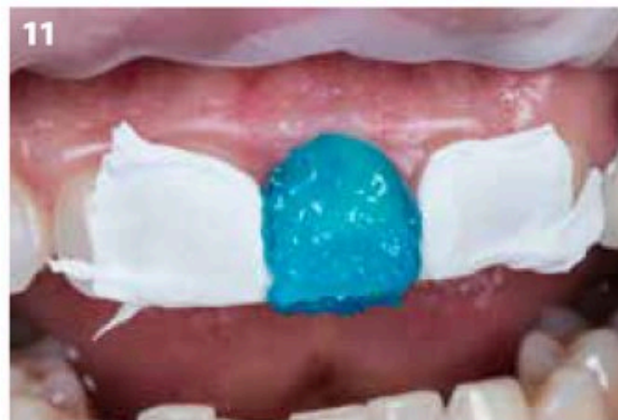
Fig. 11: The enamel of tooth 21 was etched to enhance micromechanical retention