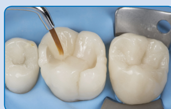
The brush can be used to adapt the material cusp by cusp.