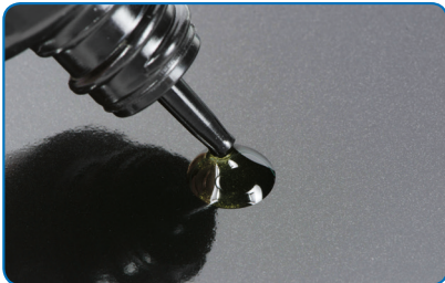
Dispense one drop of GC Modeling Liquid on a pad.