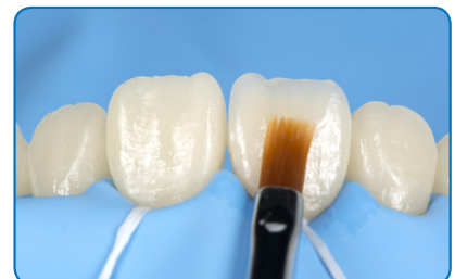
Shape and smoothen the final layer of composite using a wetted flat brush or instrument.