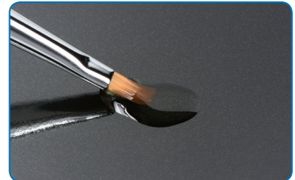
Touch the drop with the brush or instrument in order to moisten it.