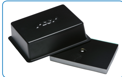
Protect it from the light with a cover.