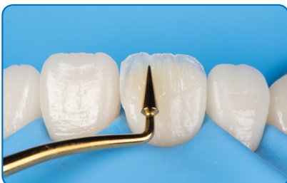
Contouring and removal of excess composite using your instrument.