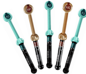
G-aenial® Anterior / Posterior