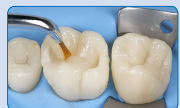
GC Modeling Liquid and the brush aide to recreate the fissures and refine anatomy.