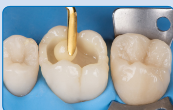
Apply the composite using your wetted instrument.

A round brush helps to build the cusps and refine the design of the fissures.