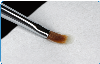
Remove the excess thoroughly using a gauze swab.