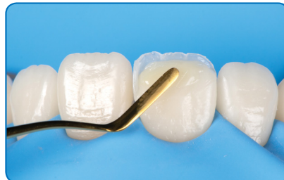
Use your instrument or brush to apply the composite.