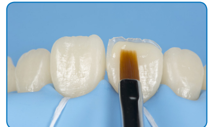
Use the flat brush to adapt and shape the composite.