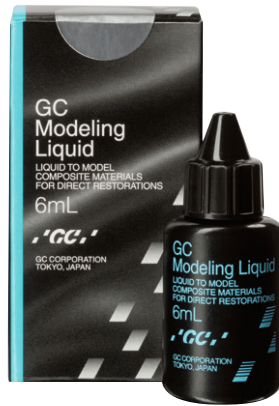
GC Modeling Liquid, Refill 6mL

Discover great handling and aesthetics with GC paste composites