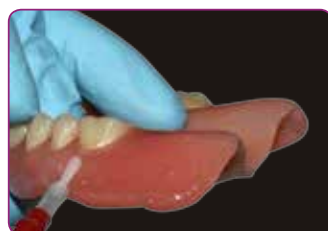
Protection of margins with Reline II finishing material

The material remains smooth and odorless and maintains its dimensional stability and elasticity for weeks or months. The result? A durable* & convenient solution for denture patients.