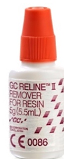
GC RELINE II Remover for resin