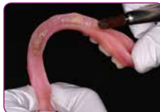
Relieve the area to be relined and roughen the surface.