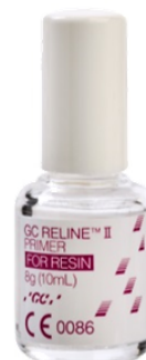
GC RELINE II Primer for resin

You can add material within 3 months after the first application, to adapt to changes of the mucosa and bone. The new GC RELINE II Remover for resin makes it possible to remove the relining layer and replace it very quickly.